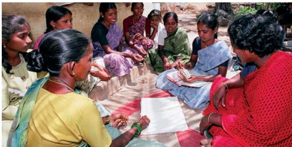
Agricultural cooperative in India

and non-farm enterprises, and to obtain skilled jobs and jobs in non-traditional agricultural export (NTAE) industries, that are better paid than traditional agricultural ones.