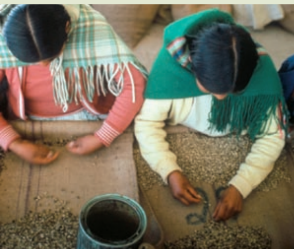
Women sorting coffee at a cooperative in the Puno District, Peru