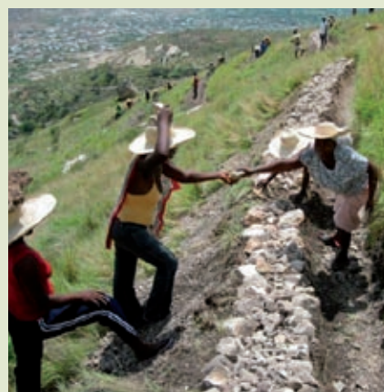
Environmental rehabilitation in Haiti.