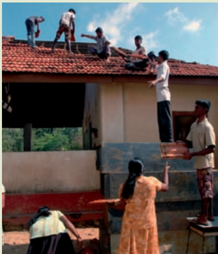
Work on a school in Sri Lanka.

Community-based infrastructure programmes are multisectoral, participatory, and respond to demands and needs identified at the local (village) level.