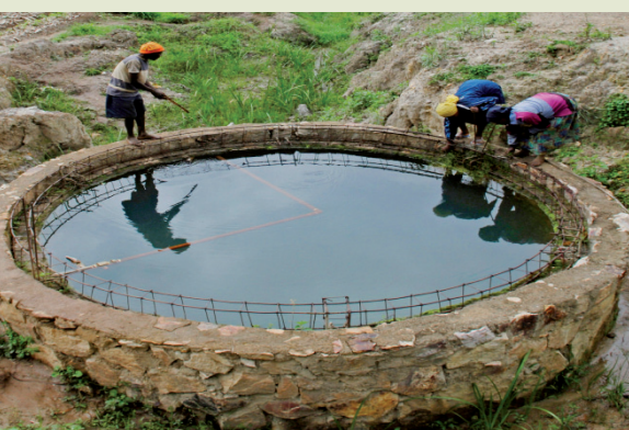
Reservoir used in Rwanda to irrigate crops.